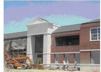
Brighton Elementary School