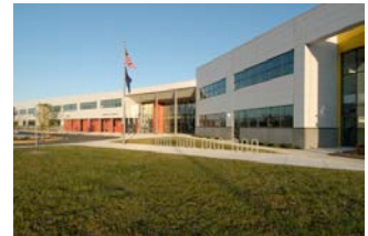
Simonsdale Elementary School