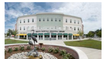
South Norfolk Memorial Library