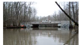
Pocaty Bridge Replacement